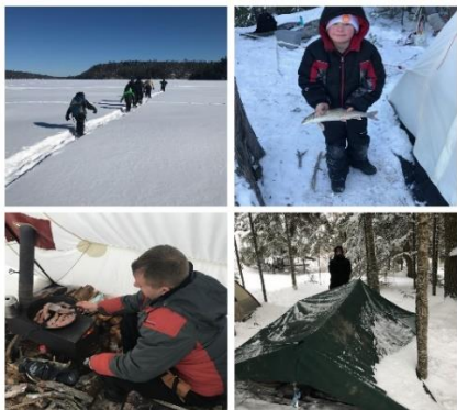
Boundary Waters Winter Camping