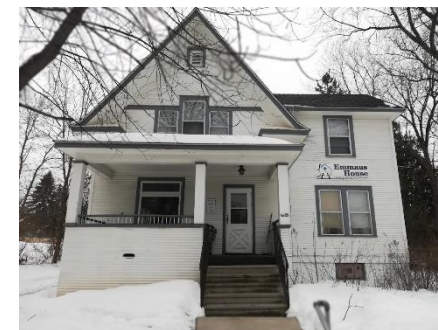
Located in: Duluth MN

Christ-Centered Discipleship Program for men coming out of life controlling sin bondage such as drugs or alcohol addiction, sex/pornography addiction, and entertainment/social media addiction