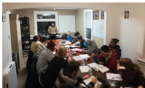
Pathfinders School of Ministry

We first and foremost, endeavor to cause men to become diligent disciples of our Lord Jesus Christ. We will also lead every man to pursue Christ for victory and freedom and to find their destiny which is hid in Him. Ref Colossians 3:3. We will help men find answers to the questions: Who am I? why was I created? and what am I here for? We will endeavor to cause men to become responsible and to become men of high moral character. Men who have dignity, integrity, honesty, and valor. Men who are disciplined, and committed and who will take the initiative.